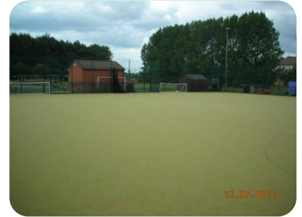
Dimensions of MUGA

Half MUGA 33m x 20m, Whole MUGA 33m x 40m