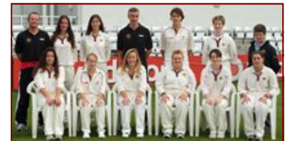
County senior squad 2006