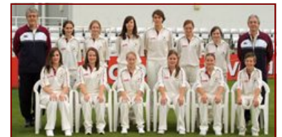
County U15 squad 2006