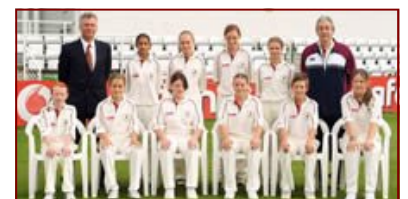
County U13 squad 2006